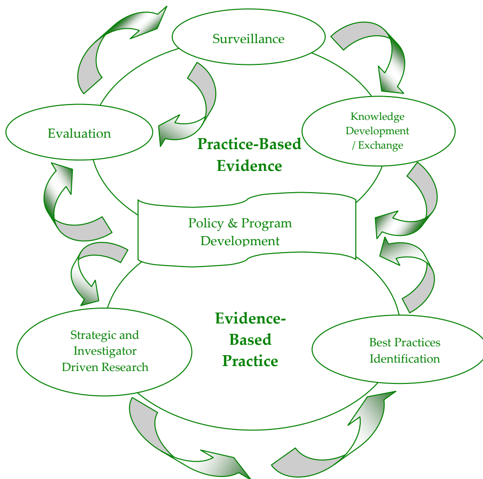
Figure1: Manitoba Risk Factor Surveillance Conceptual Model

The conceptual model in Manitoba ensures that communities, regional committees and organizational/government partnerships and policy makers at all levels have access to community-specific risk factor surveillance information, their own local program evaluation information, and practice-based evidence for intervention, program and policy development. All data and information is to be integrated within a systematic evidence-based program planning framework.