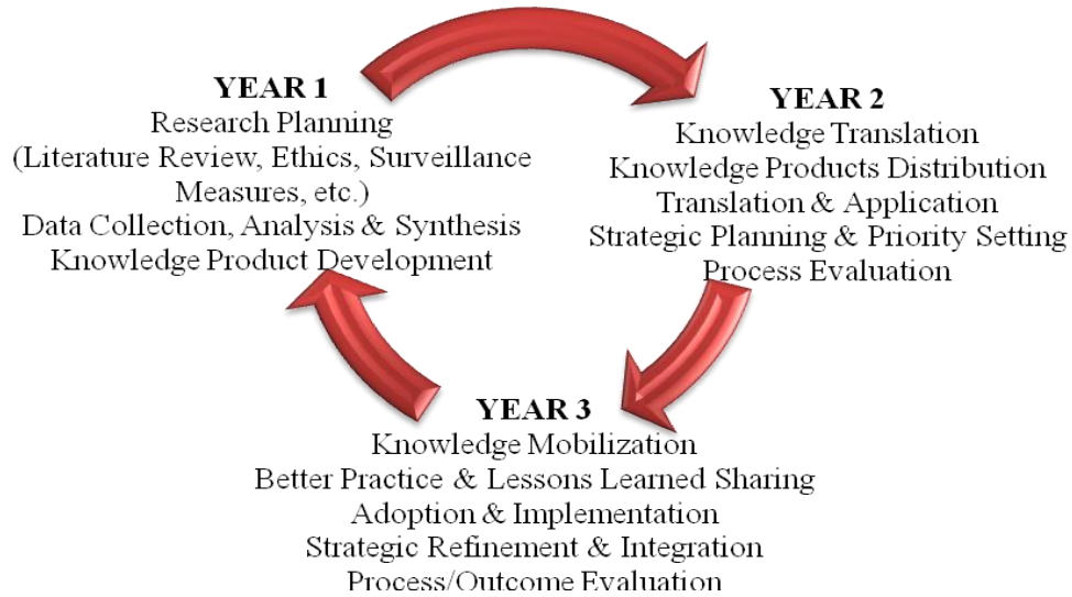
Figure 2: New Brunswick Knowledge Exchange and Research Uptake Model

The knowledge development and exchange framework used in New Brunswick integrates activities of the NB Student Wellness Surveillance and Knowledge Exchange Initiative within a three year cyclical process (Fig. 2). In addition, New Brunswick has contributed to and applies the SHAPES Knowledge Development and Exchange Model (Fig. 3). View the Wellness Strategy Framework at http://www.gnb.ca/0131/wellness-e.asp